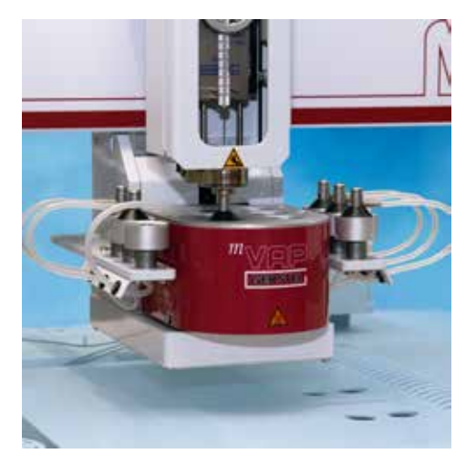
<sup>m</sup>VAP: Simultaneous evaporative concentration of up to 6 samples