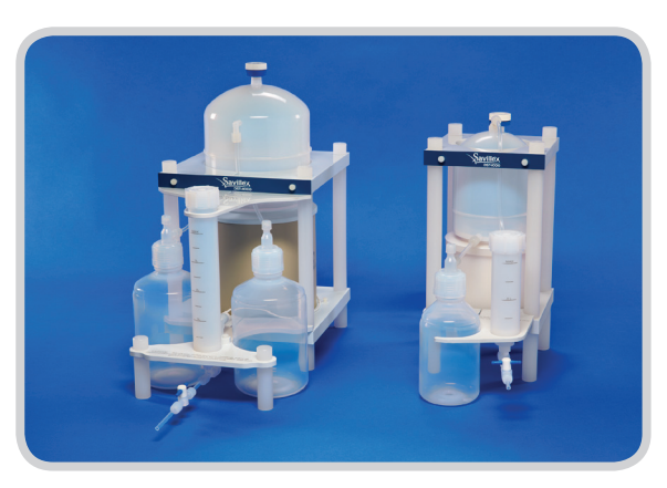
Savillex DST-1000 & DST-4000 Acid Purification Systems

The ultra low detection limits of ICP-MS necessitate the use of high purity grade acids for the preparation of standards, sample dilutions and increasingly, even for sample digestion. Although commercially available bottled high purity (10 ppt) grade acid is readily available, it costs up to ten times more than trace metal (1 ppb) grade acid. Once