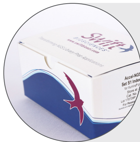
The Accel-NGS 2S Indexed Adapter Kits are available as individual sets (S1, S2, S3, S4) or as one complete set (S1-S4).

The Accel-NGS 2S Indexed Adapters are a set of 96 single indices optimized specifically 1 to work in combination with either Illumina's universal P5 adapter for 96-plexing or with Illumina's eight TruSeq® HT i5 indices to provide up to 768 unique dual index combinations. These new indices were optimized specifically to provide greater flexibility to process between 12-768 uniquely tagged samples per run and to accommodate a wider range of projects with varying sequencing depth.