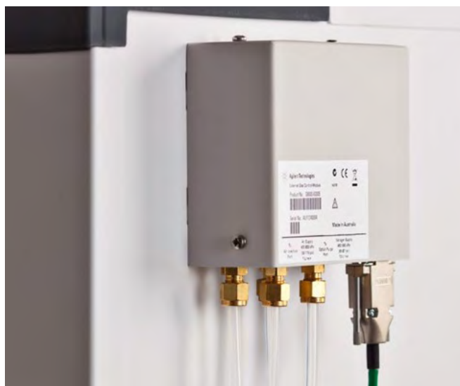
Figure 1. External Gas Control Module (EGCM) accessory for the Agilent 4200 MP-AES

All measurements were performed using an Agilent 4200 MP-AES. In order to analyze Na, K, Mg, and Ca in IPA directly, without dilution, the instrument was fitted with an Agilent Organics Kit comprising the EGCM, inert OneNeb nebulizer, solvent resistant tubing, and a double pass spray chamber.