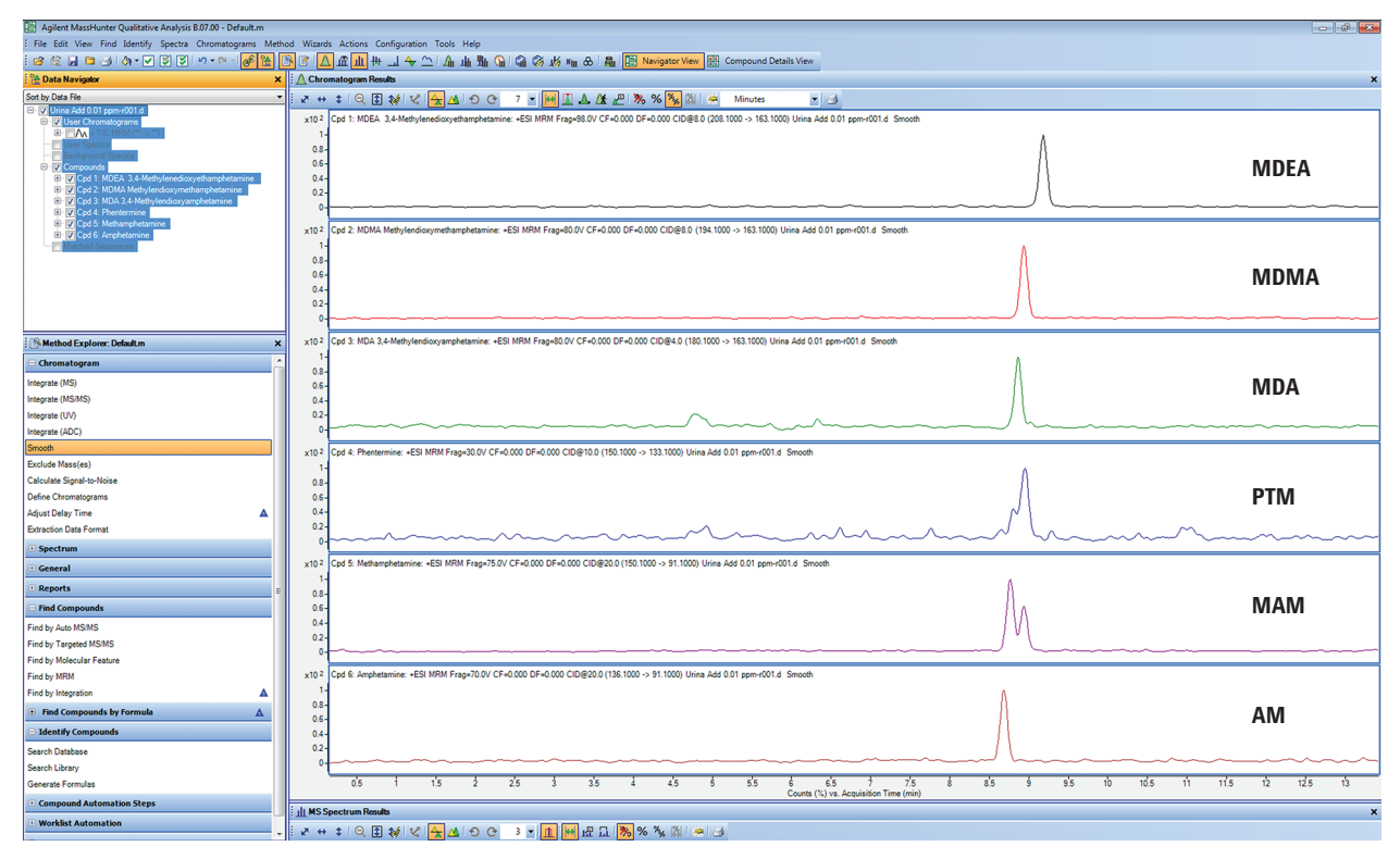
Figure 3. CE-MS/MS electropherogram of a blank urine sample spiked with a mixture of the amphetamine and its derivatives at 0.01 µg/mL each using a PVA-coated capillary. MDEA, MDMA, MDA, PTM, MAM, and AM.

Precision and accuracy, expressed in terms of recovery from urine samples, were studied by analyzing spiked samples at three different concentration levels, in quintuplicate. Table 3 shows these results. Figure 3 shows a blank urine sample spiked with mix of AM, MAM, MDA, PTM, MDMA, and MDEA at 0.01 \mu g/mL each.